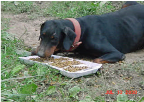
EARS Provides Food and Water to those Pets Left Behind

United Animal Nations created an organization called the Emergency Animal Rescue Service (EARS), which is devoted to saving animals affected by disasters. Unfortunately, due to poor planning, and a lack of shelters for pets during such emergencies, many beloved pets are left behind, without adequate resources to survive, during disasters.