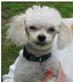
Sparky, 12 Year Old Male Toy Poodle

I've been told I have excellent house man-