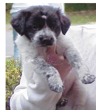
Tippy, Female Border Collie Mix Puppy